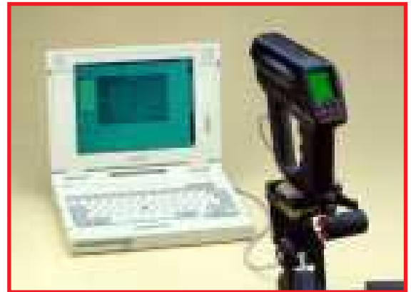
PC data transfer

Published specifications may change without notice.